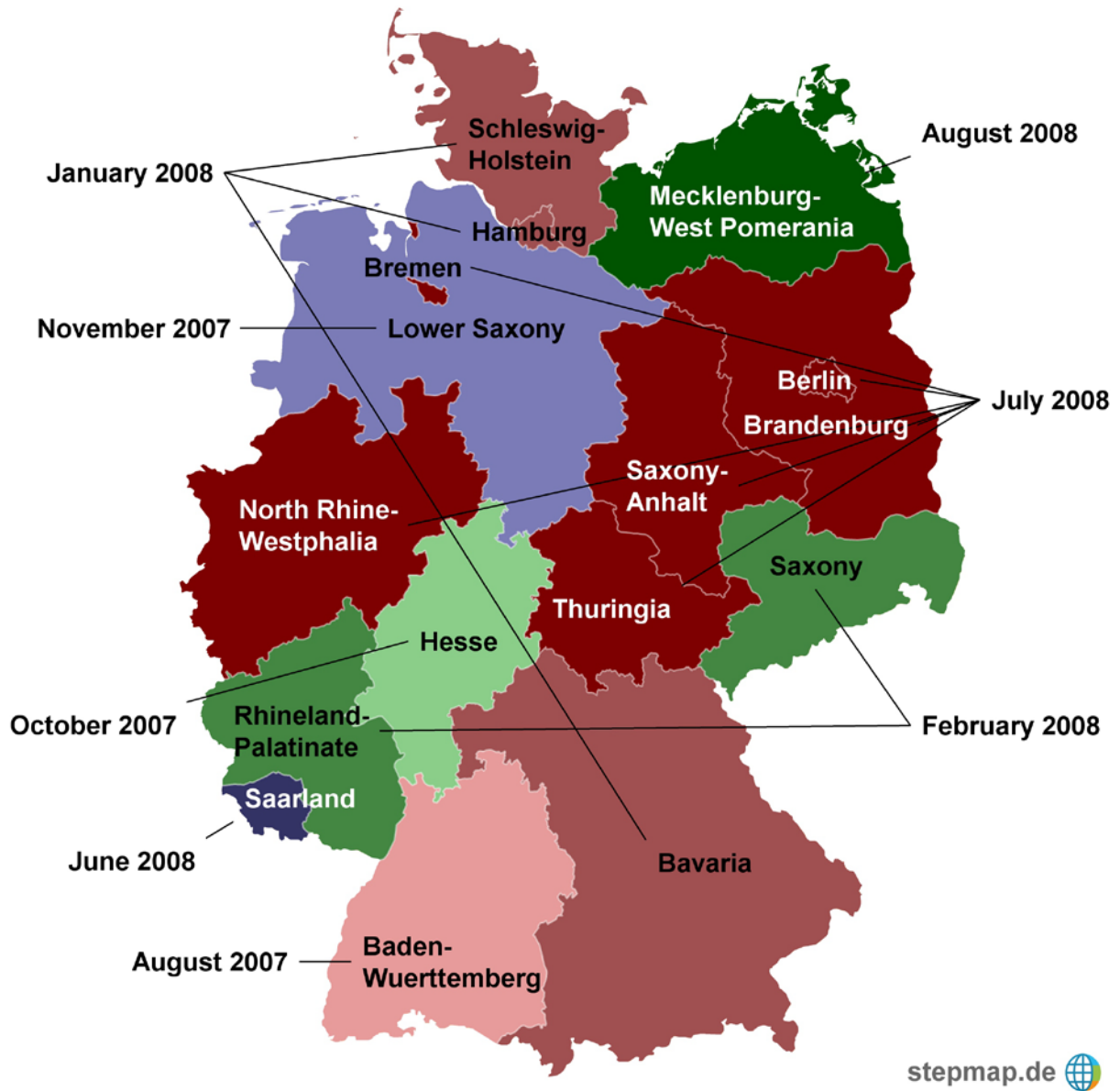
Figure 1: Dates of Enforcement of State Smoking Bans in Germany

Notes: For further information, see notes to Table 1.