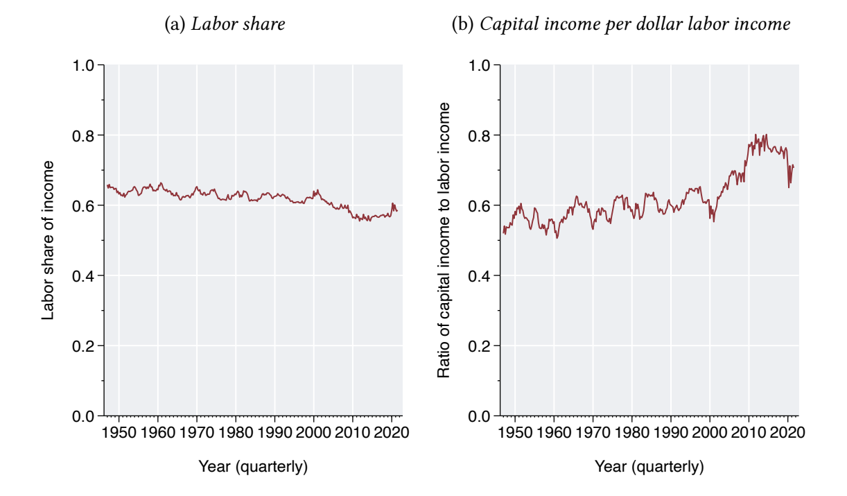
Figure 1: RELATIVE FACTOR INCOMES: United States nonfarm business sector, 1947Q1-2021Q3