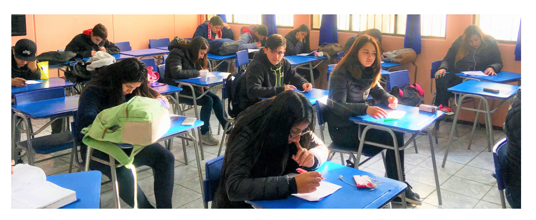
Figure A1: Example of the data collection setup. The data collections were conducted by trained field-workers during regular schooling hours. The data collection took place in form of a self-administered paper pencil survey. During the interview students were sitting in a standardized seating order and were not allowed to talk in order to prevent interactions.

Table A11: Treatment effect over time in the sample: Bottom 85% according to GPA ranking at baseline. Coefficients are two-way fixed effects estimates. The regressions include fixed effects for individuals and time. Standard errors clustered at school level are shown in parentheses. The panel covers two points in time: endline and 4-year follow up. The prosociality measure (at both points in time) corresponds to the endline measure as described in section 2.4.2. To construct the measure at follow-up, we use the same three items as at endline, use the endline distribution for the standardization, and apply the PCA weights from the PCA at endline. Therefore, we use the same measure (with the same metric) at endline and at follow-up. Column 2 applies inverse probability weights that account for potential selective attrition and are estimated from a probit model of a binary selection indicator (indicating whether an individual is available for this analysis) regressed on baseline measures of achievement, gender and SES, the treatment dummy and the interactions of baseline measures and the treatment dummy. See also table A2 column 3. ***, **, * indicate significance at the 1%, 5% and 10% level, respectively.