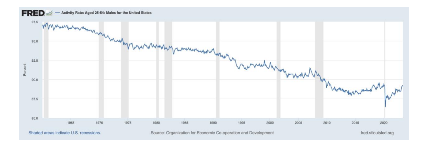
FIGURE 1: Labor Force Participation, Prime-Age Men

FIGURE 2: Labor Force Participation, Prime-Age Women