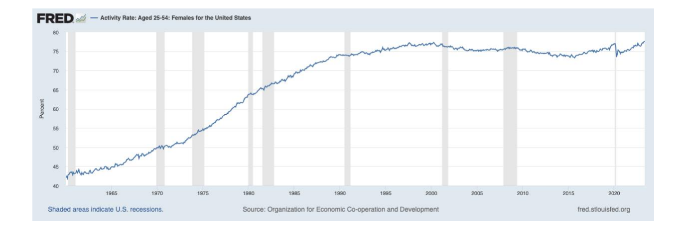
FIGURE 2: Labor Force Participation, Prime-Age Women