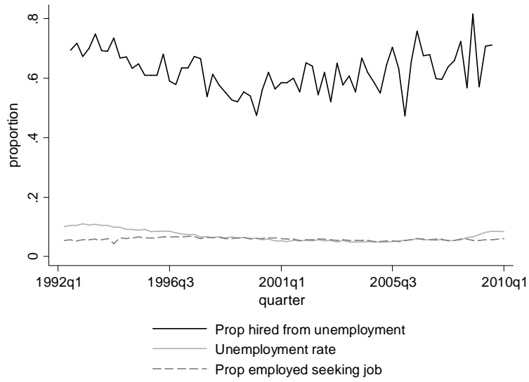
Figure 1: Proportion of hires from unemployment