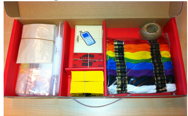
Figure 1: Course material

Schools sign up for the program at the beginning of each school year (before January). The children participating in the program are aged 11 or 12 and are in the last grade of primary school. Most schools have either one or two (parallel) classes in last grade. In general, the decision to participate is taken at the school level. The minimum level of participation is an entire class, i.e., individual pupils or teams cannot participate. The five-day program usually takes place within a period of 2 to 4 weeks during the last few months before the pupils go to high school. It is a structured program and a day-by-day overview of the content is shown in Table 1.